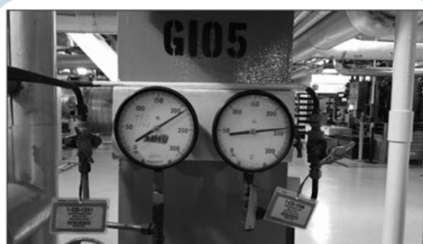
Exhibit 2. Manual Gauges

At an average cost of $1,800 per gauge, the WGR is less than one-fifth the cost of using conventional instrumentation. The data provided by these devices help to detect faults to minimize unplanned downtime (e.g., pump and valve failures), reduce labor to manually log data, optimize the process efficiency for different operating scenarios, and enhance safety by lowering radiation exposure for workers. This technology is already installed at three nuclear