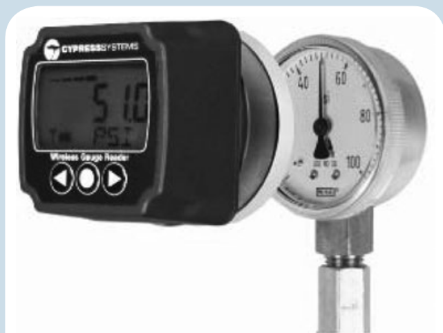
Exhibit 4. Electronic Eyeball