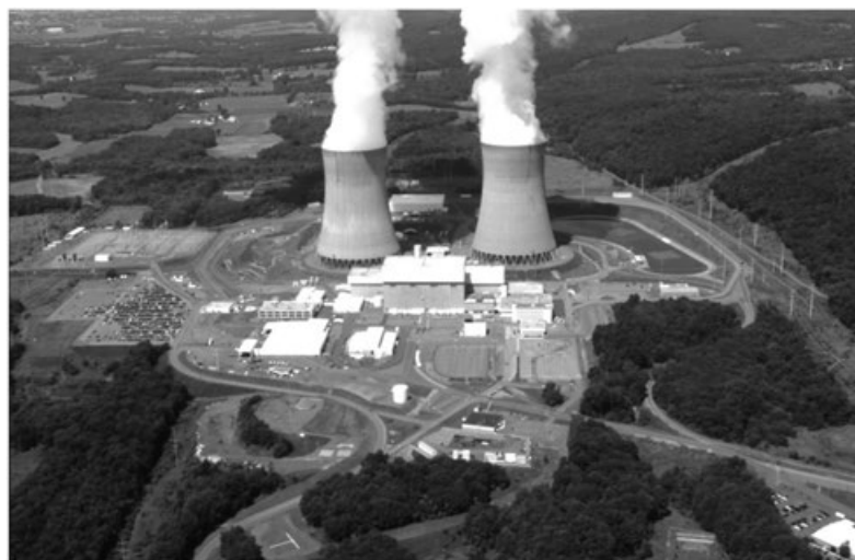
Exhibit 1. Nuclear

The task involves detailed engineering design and assessment, which must be reviewed and ap-