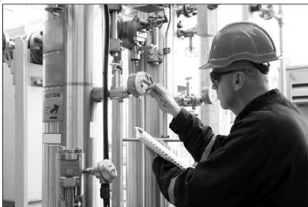
Exhibit 3. Data Reporting

In addition to dial gauges, noninvasive wireless-level indicator readers and analog vibration monitors are also available from Cypress Envirosystems and are similarly easy to install. Together, these solutions can quickly and cost-effectively digitize existing process data, and enable the huge savings promised by IIoT.